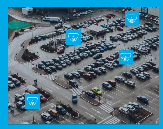
DIFFICULT AND EXPENSIVE WIRING CONNECTIONS

Range can be another challenge with Wi-Fi. Businesses often try to expand their range by blanketing their facilities with access points to provide better network connectivity. This solution can be costly. As your operations expand, the number of access points needed will continue to grow — leading to additional business expenses.